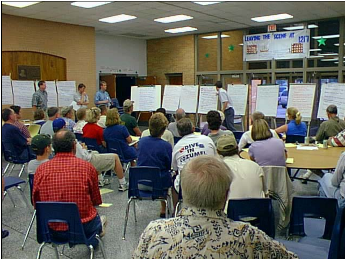
Brown County Planning Commission/Green Bay MPO December 7, 2016