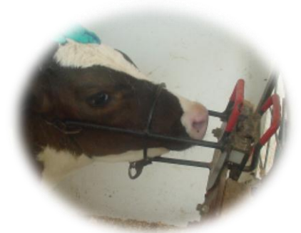
An example of proper head restraint

*All drugs mentioned in this factsheet require a veterinary prescription and should be done only in the context of a valid Veterinarian/Client/Patient Relationship (VCPR).