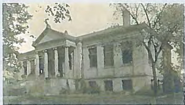
Historic Kellogg/Carnegie Library building