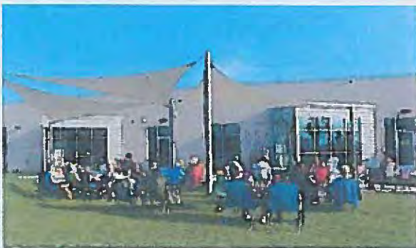
East Branch Library