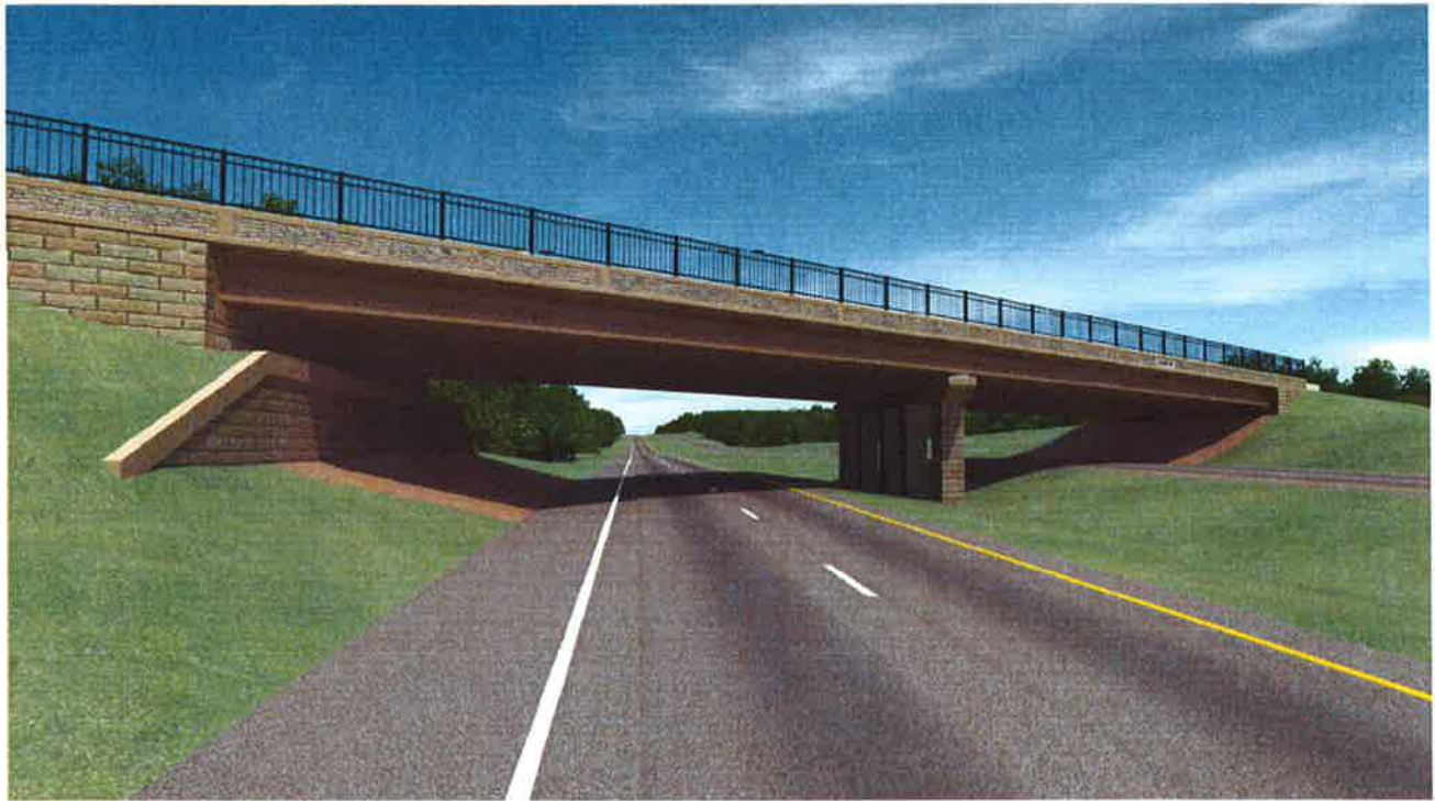
County FF overpass looking west