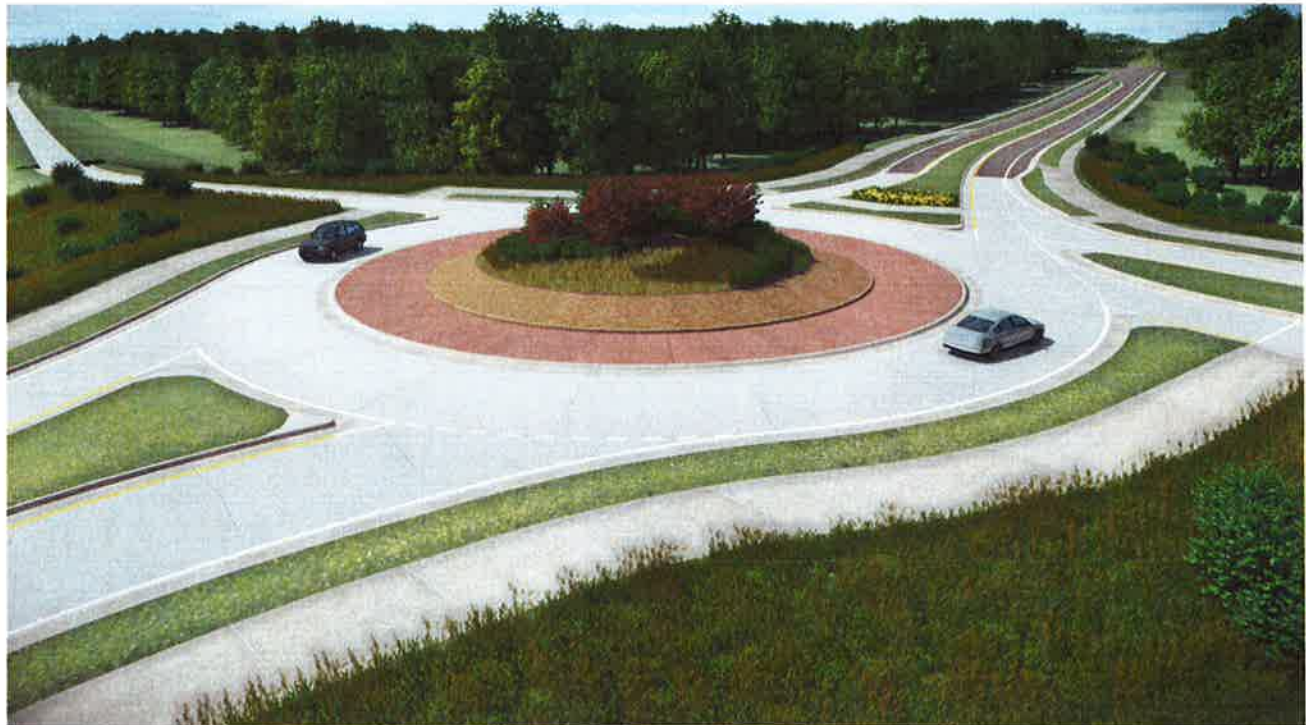
Ramp roundabout looking northwest